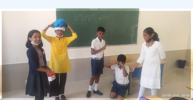
Hindi Save water जल है तो कल है