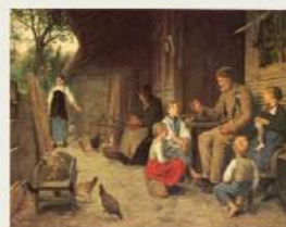
Oral tradition of storytelling