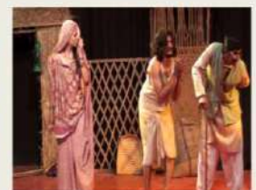
Drama and plays