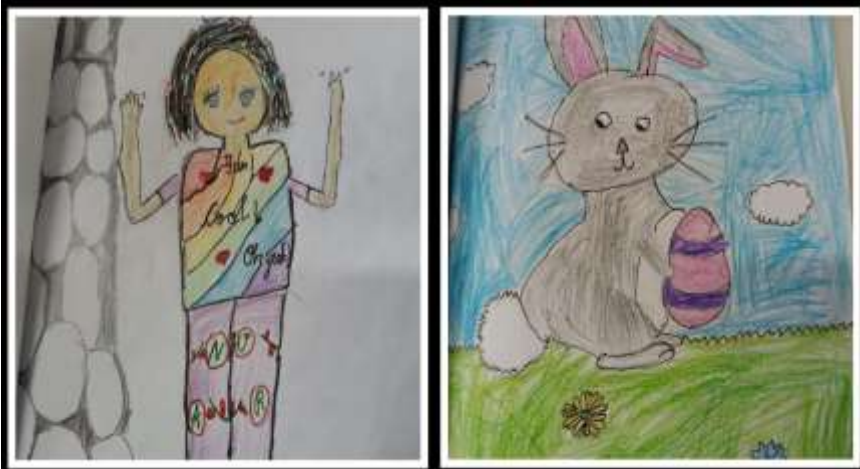
AYREEN -III A