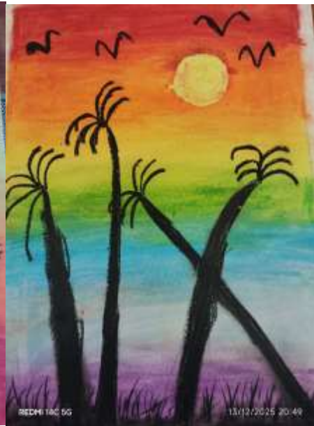
JAYAKARTHIKEYAN -III B