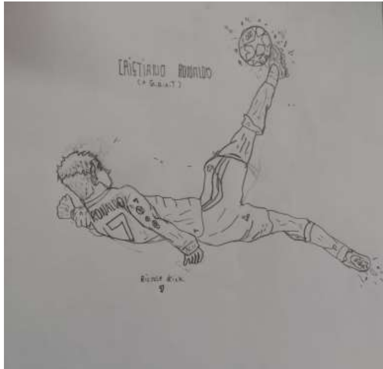
AYREEN -III A