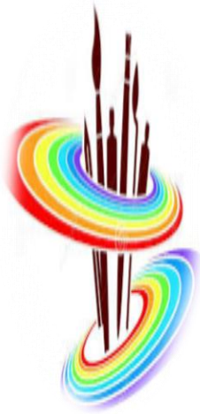
Keshav V B, 23july2023